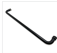
C60-0021 • C60-0023